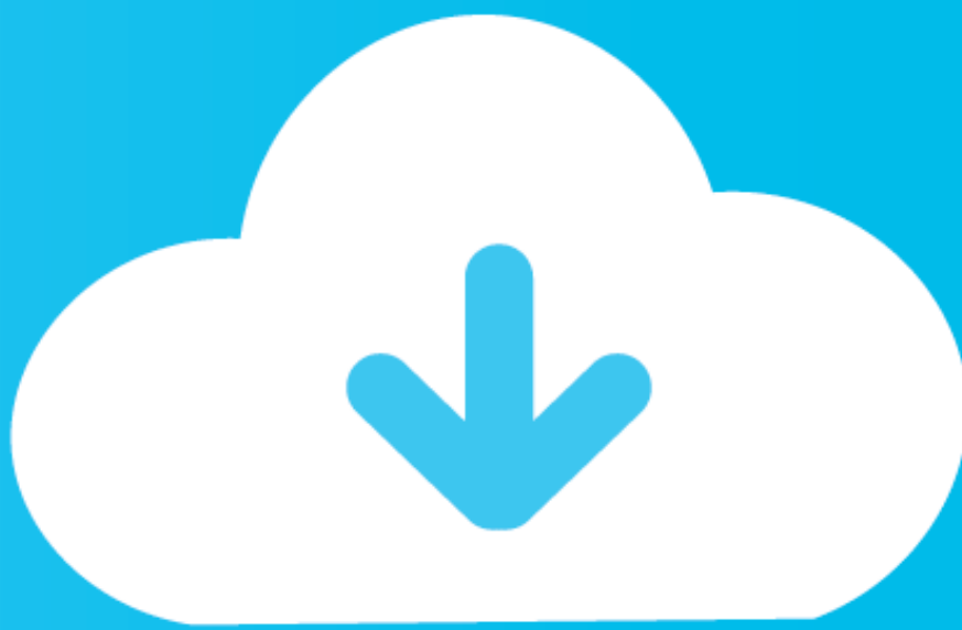
Prinect Sigma Station 2017.17.00.6206